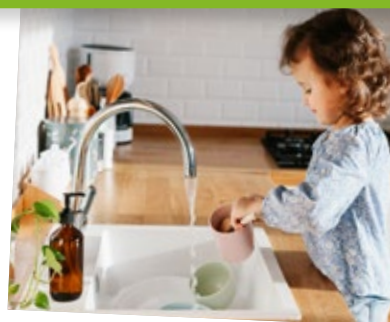
Try it at home

Encourage families to get involved at home by experimenting with filling the sink with dishes (measuring the water before and after the dishes are added) and at bath times by marking the bath water level before children get in and once they are in the bath.