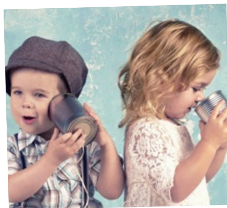
The next generation of influential figures

All activities must be risk assessed and water activities must be supervised by adults.