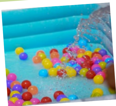
Water ball pit

Create a 'tin foil river' for children to float their boats. Lay out the tin foil to the length of river you require. Roll up each side of the tin foil to create an edge/barrier to keep the water inside. Add the water and pop in some boats for the children to play with. Add some blue food colouring to make the water more visible.