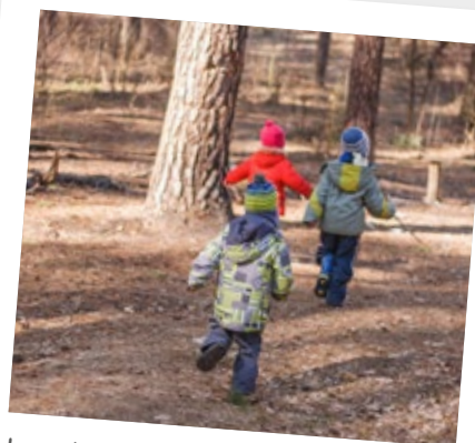
Learning through exploration