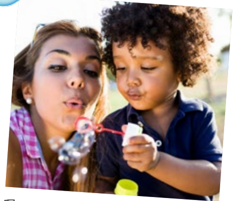
The perfect mix