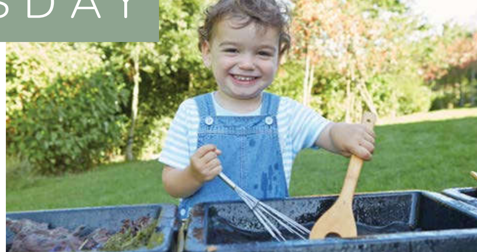
EY06044 Outdoor Discovery Table with Rubber Trays

Allow children to connect with their surroundings and explore the outdoors with resources from TTS.