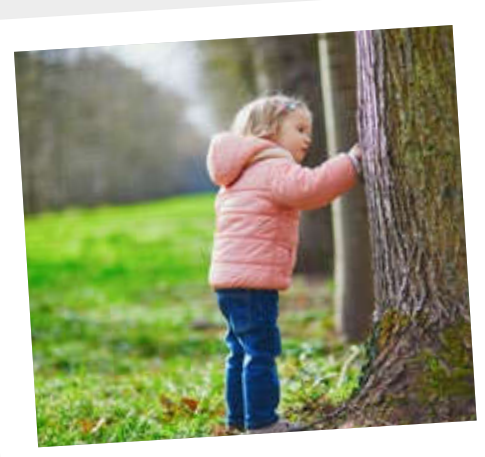
Create a bark rubbing

paper to take bark rubbings from the tree. Place the paper against the tree and lightly colour with the crayon to create a print of the trunk. Talk to rubbing and then display the creations inside, or hang them from the drawing tree, so that children can look at them during outdoor play.